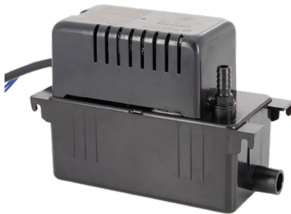
1/2" ID tubing side inlet