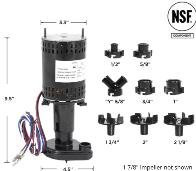
UNIT COMES WITH 4 DIFFERENT IMPELLERS AND 5 DIFFERENT DISCHARGE SIZES.