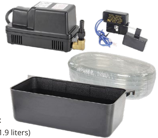
Tank Capacity: 2.0 US quart (1.9 liters)